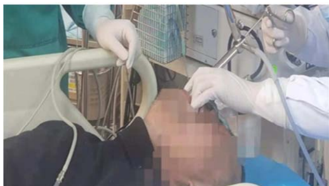
Figure 3. Supplementary: the metal wire was removed out successfully by rigid esophagoscopy.